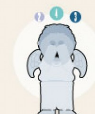
The Weeping Angels

Probably the scariest of the new crop of monsters. The touch of an Angel sends it's victim back in time, allowing the Angel to feast on the energy of their un-lived days. The Angels were responsible for the departure of Rory and Amy, sending them back to 1938 to live out their lives. First appearance 'Blink' 2007