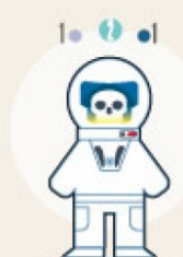
The Vashta Nerada

Microscopic swarming carnivorous creatures who's name means 'the shadows that melt the flesh' and capable of reducing a human to bare bones in milliseconds. The Vashta Nerada live in the darkness creating shadows wherever they go. First appearance 'Silence in The Library' 2008