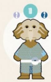
The Sea Devils

Amphibious relatives of the Silurians, the Sea Devils woke from hibernation and attempted to reclaim the Earth in 'The Sea Devils' broadcast in 1972