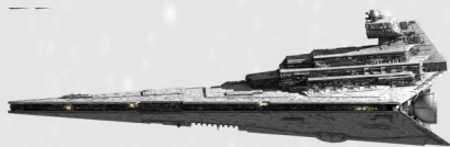
Star Destroyer X 1

Place the ships below in the grid above.